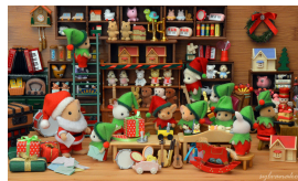
SANTA'S WORKSHOP FRI. DEC. 14TH