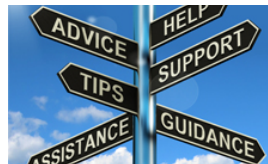
PARENT EDUCATION MEETING FRI. DEC. 14TH